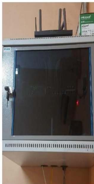
LAN Box Switch-4