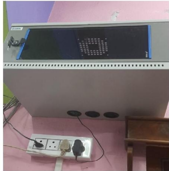
LAN Box Switch-2