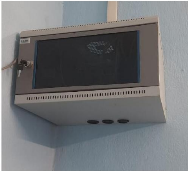
LAN Box Switch-1