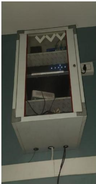
LAN Box Switch-3